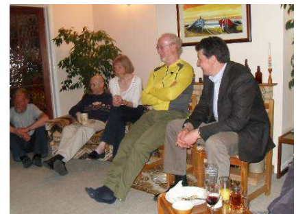
Some of the happy crowd